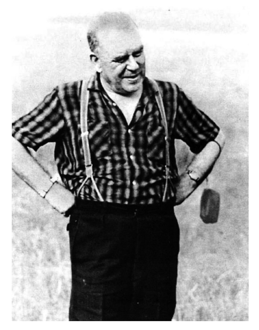
FIGURE 5 – Viktor Sochava at Haranor station, 1967 (VOROBIEV et al. 2001).

the rhythms of natural phenomena and justify the division of the territory into special areas called physical-geographical facies. V. Sochava believed that this region is unique because it is one of the types of Asian steppe landscapes penetrated into the taiga zone (SOCHAVA 1964).