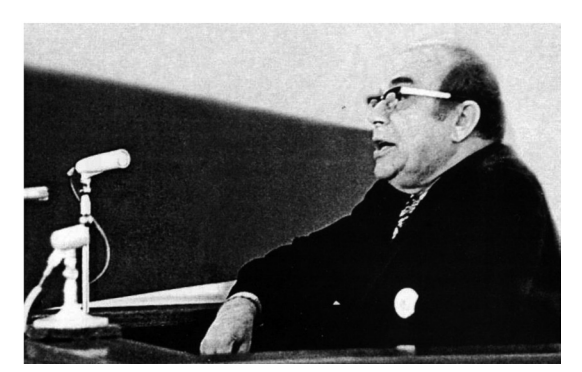
FIGURE 3 – Viktor Sochava's speech at a symposium on the topology of geosystems in Irkutsk, 1971 (VOROBIEV et al. 2001).

Geobotanic mapping should be separately highlighted in the scientific heritage of V. Sochava. Together with the famous botanist Evgenij Mihailovich Lavrenko (1900-1987), he supervised the development of the "Vegetation Map of the European Part of the USSR" (1950) and the "Geobotanical Map of the USSR" (1954). Founded by V. Sochava in 1963, the yearbook "Geobotanical Mapping" was the only publication of its kind in