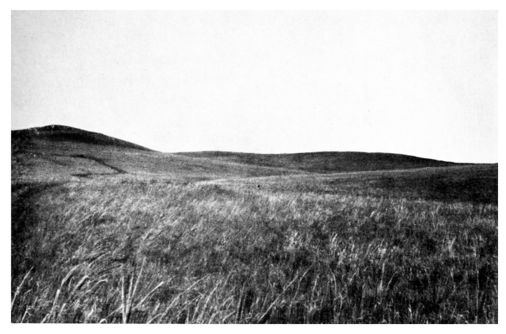
FIGURE 2 - View on the territory of Onon-Argun steppe. Photo by V. Sochava (SOCHAVA 1964).

Geobotanic issues have an important place in the scientific heritage of V. Sochava. He participated in compiling reports on taiga vegetation published in 1953 and 1956. In his early works, he approached the history of vegetation, observing florogenesis and phytocenogenesis as a single process. His