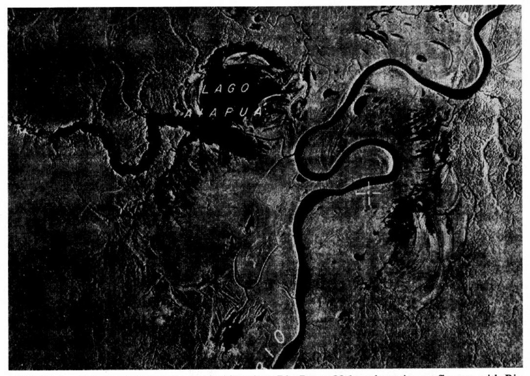
FIGURE 2 – Pleistocene Várzea – Lago Aiapuá on Rio Purus 80 km above its confluence with Rio Solimões. The "river-like" western part of Lago Aiapuá is the drowned valley of its affluent. North of this affluent the Pleistocene flood plain is best to be recognized. The ridges and swales are well developed. For scale: Lago Aiapuá has a N to S distance of 8 km.

extent of the floodplains with the areas studied. Nevertheless, it seems possible from our sedimentological and geochemical/mineralogical studies to establish the basic principles for the genesis of Pleistocene sedimentary deposition in the Amazonian Quaternary floodplains.