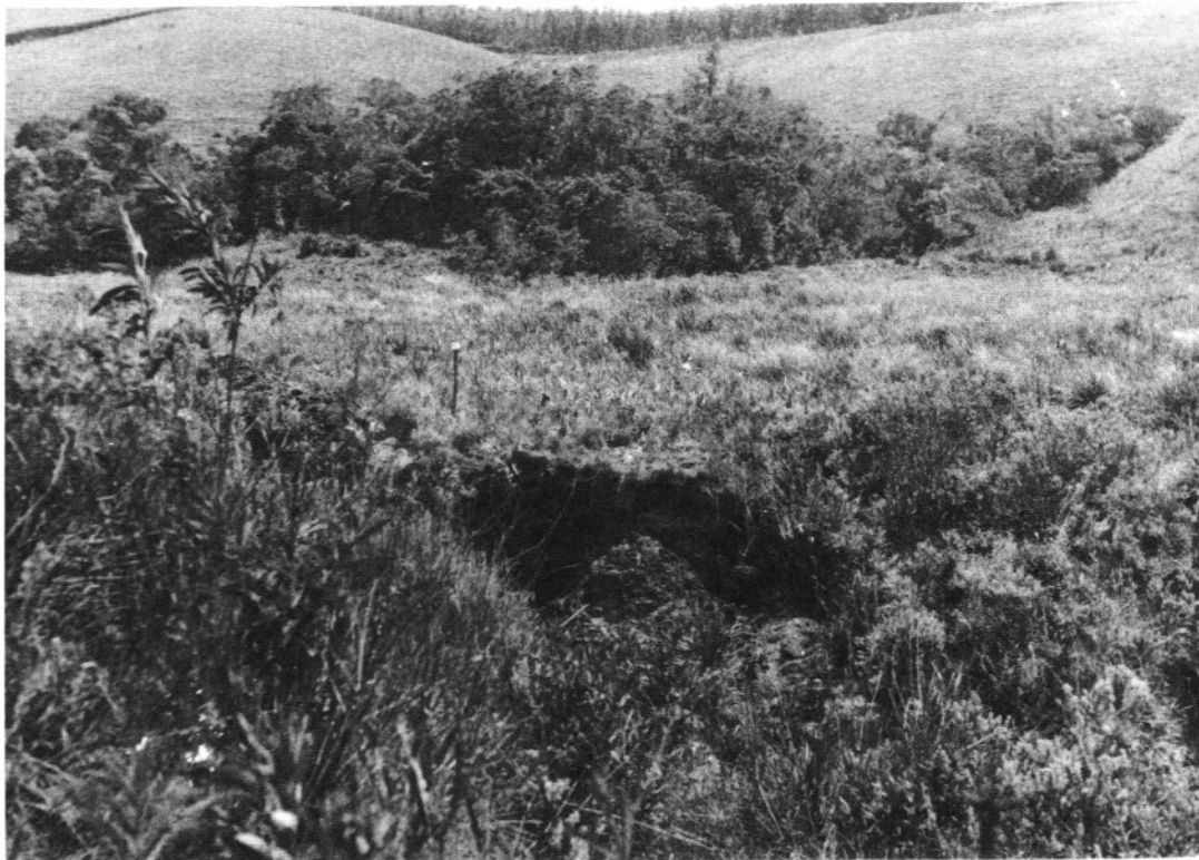
PHOTO 1 — Peat deposit at the bottom of an erosion amphitheater in the "altos campos".